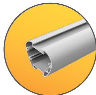
Channels to fix accessories