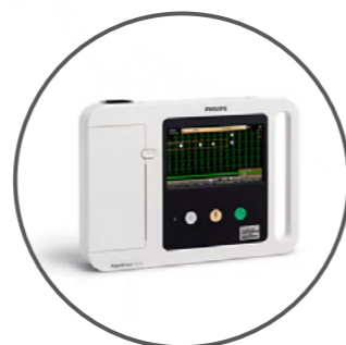
Mounting for device

Designed and manufactured in Hungary, products are typically 100% recyclable and upgradable in the future. Raw materials are sourced locally or in the EU.